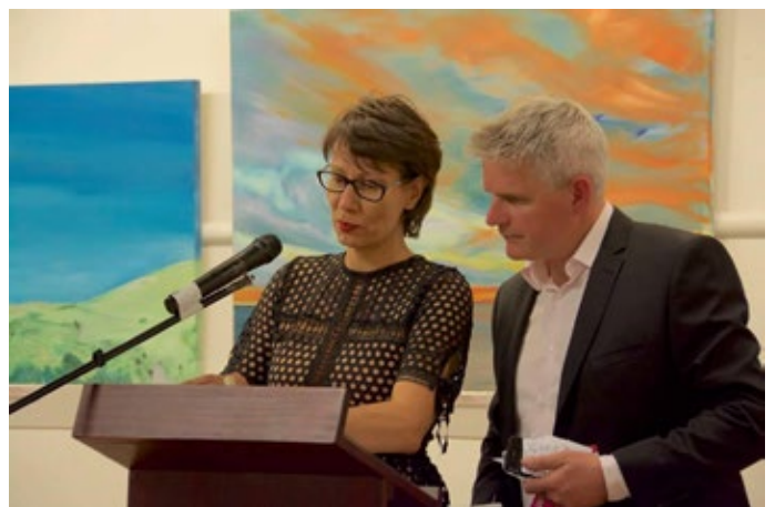
Guests, artists and PAF members at PolArt Exhibitions.